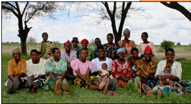
Activity: # of women in maternal health club.