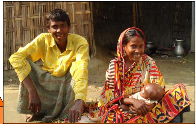
Impact: # of women surviving childbirth.